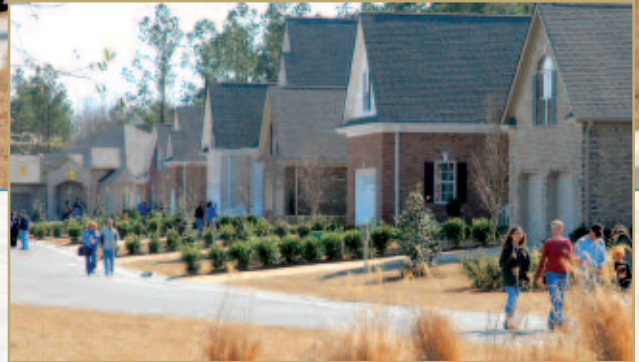
Above: Cars line the streets as visitors tour the model homes Above Right: Families stroll in and out of homes along Dream Street

“We have something for everyone here, from maintenance-free town houses and cottages that have great appeal to empty nesters and retiree's, to estate home sites with gorgeous views that can accommodate grand custom homes, and