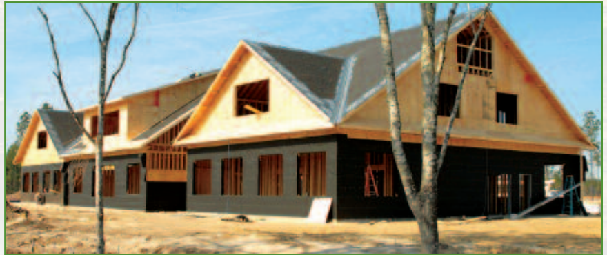
Above: Welcome Center under construction.

With work progressing at a rapid pace, Brunswick Forest's 16,000-square foot Welcome Center is on schedule to open at the end of 2007. Visitors to the community will then be welcomed in a sales and information facility with soaring ceilings, colorful graphics, and high tech presentations covering all aspects of life in Brunswick Forest, along with the latest real estate offerings and a complete homebuilding center.